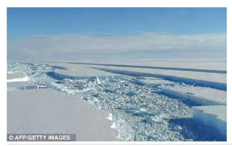
Cold facts: Antarctica actually warmed up during medieval times, contrary to what climate scientists believe

In fact, it extended all the way down to Antarctica.